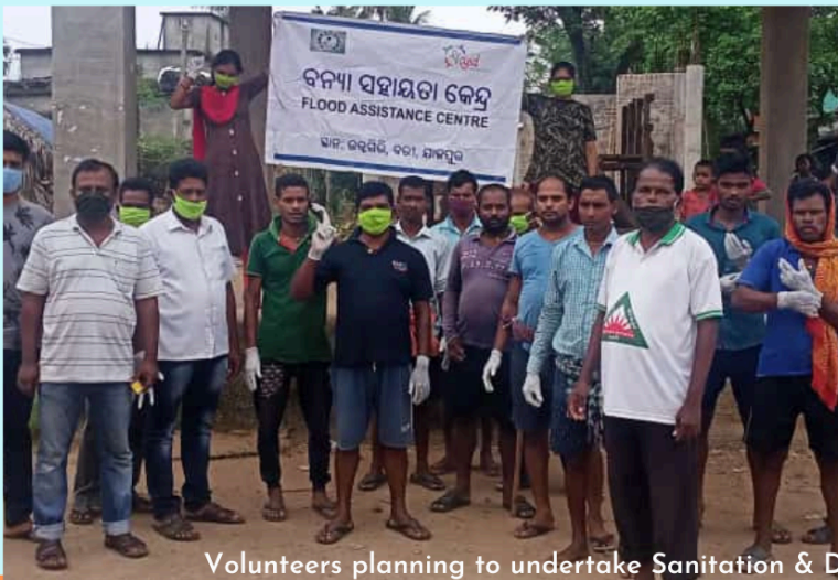
Volunteers planning to undertake Sanitation & Disinfection work int Ratnagiri GP