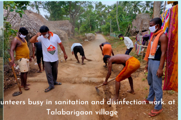
Volunteers busy in sanitation and disinfection work at Talabarigaon village