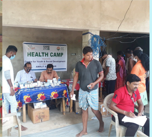
Health check-up of patients being carried out and free medicines served to patients at Ratnagiri GP