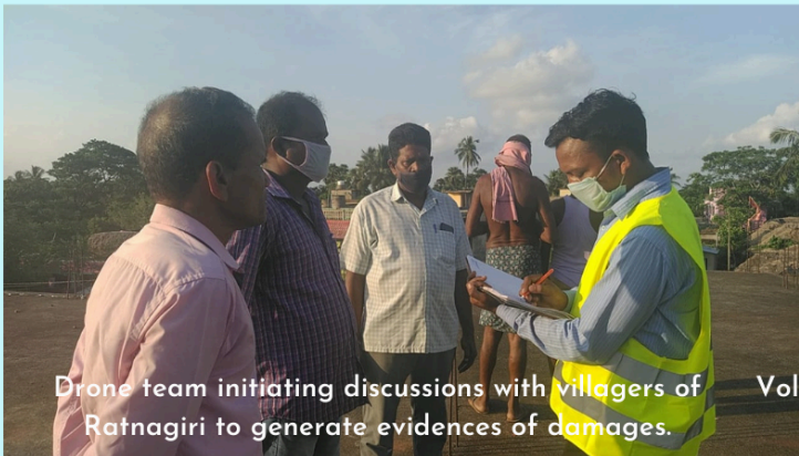
Drone team initiating discussions with villagers of Ratnagiri to generate evidences of damages.